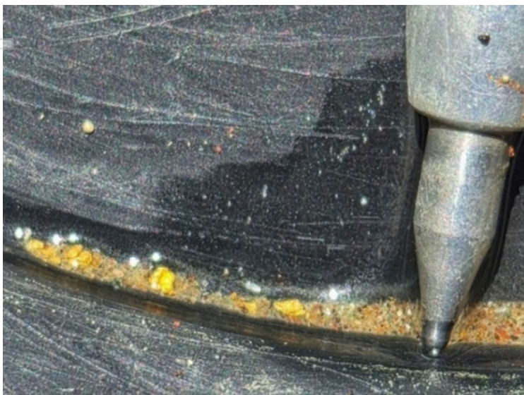
Figure 1. Visible gold panned from rock chips in previously reported Amy Clarke aircore hole 25ACAC007 from 11-12m which recorded an assay of 23.9 g/t gold from 10-12m downhole (scribe pen used for scale) 1 . Refer to GSN ASX announcement dated 6 November 2025.

1 The Company cautions that visual gold is not a proxy for mineral abundance. Reported laboratory assay results provide the most accurate estimate of the grade and widths of gold mineralisation. Please refer to GSN ASX announcement dated 6 November 2025.