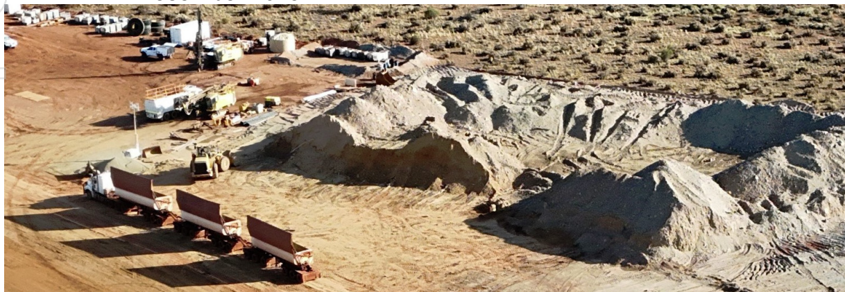
Photo 1: Triple Road Train Moving High-Grade Material from Neta ROM to Three Mile Hill Mill – 12 December 2025