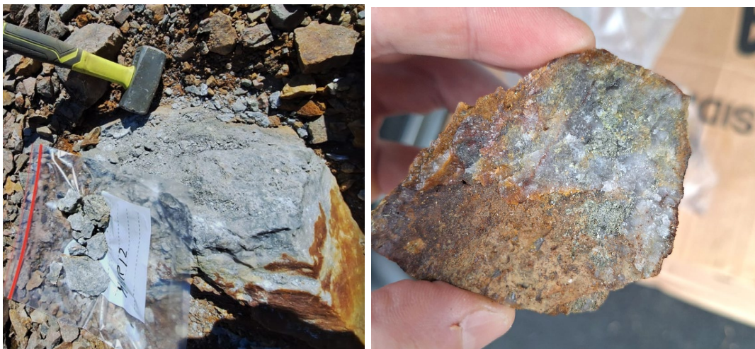
Figure 1: (left) Photograph of sample Har12 from Harnäs that assayed 15.9 g/t gold, 5.0 g/t silver which contains approximately 15% pyrite sulphide; (right) photograph of sample Sil05 from Silvergruvan that assayed 18.9 g/t gold, 17.7 g/t silver which contains approximately 4% pyrite sulphide, 0.8% galena and 0.4% chalcopyrite sulfide

Further channel sampling and drilling will be required to validate these emerging geological and structural interpretations.