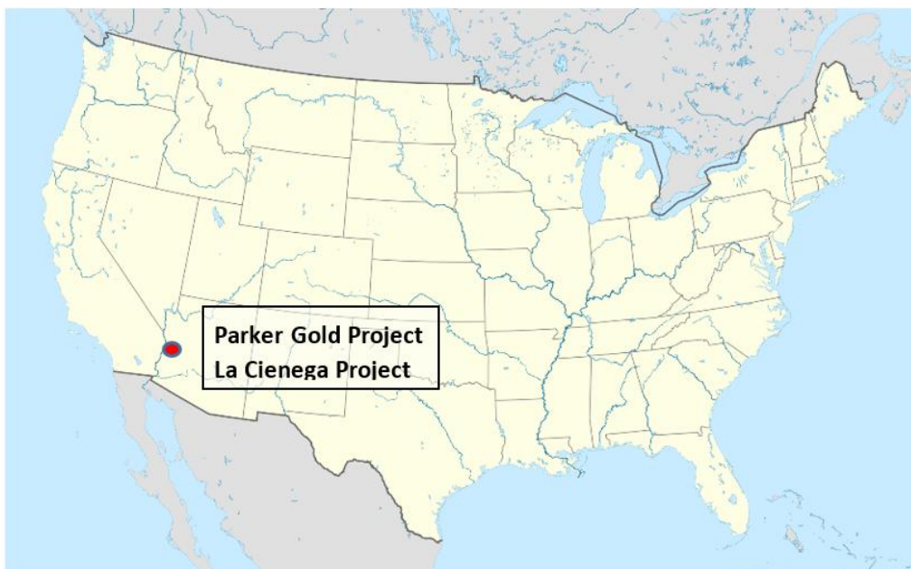
Figure 1 – The location of the Parker Gold and La Cienega Projects in Arizona, USA.

In parallel, drilling remains underway across our wholly owned Palmares and Azimuth rare earths projects in Brazil. With a disciplined and well-defined exploration pipeline underway across multiple highly prospective targets, it is an active and exciting period for Magnum, and I look forward to providing further updates as we continue to execute our strategy."