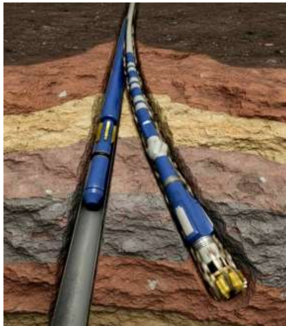
Figure 1: Image of the type of whipstock to be used at the Mt Fuel Skyline Geyser Well.

The approved re-entry program, see ASX Annoucement 12 May 2025 , was abandoned. After consultation with regulators a modified drilling program was developed and approved using the existing Mt Fuel well-bore to approximately 450’ before a hole is drilled into the casing and a whipstock inserted to permit the drilling of a paralell well to the target depth. The drilling rig has remained on site and work re-commenced.