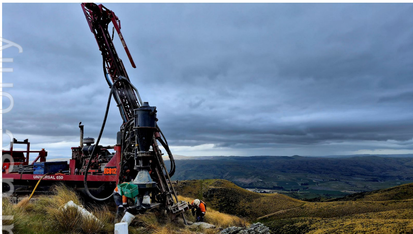
Figure 1 – Ecodrilling NZ -UDR650 Multi purpose drill rig at the Cap Burn Gold Project (hole CBRC0015) with OceanaGold's (TSX:OGC) +10 Moz Macraes gold camp on the horizon (looking East).