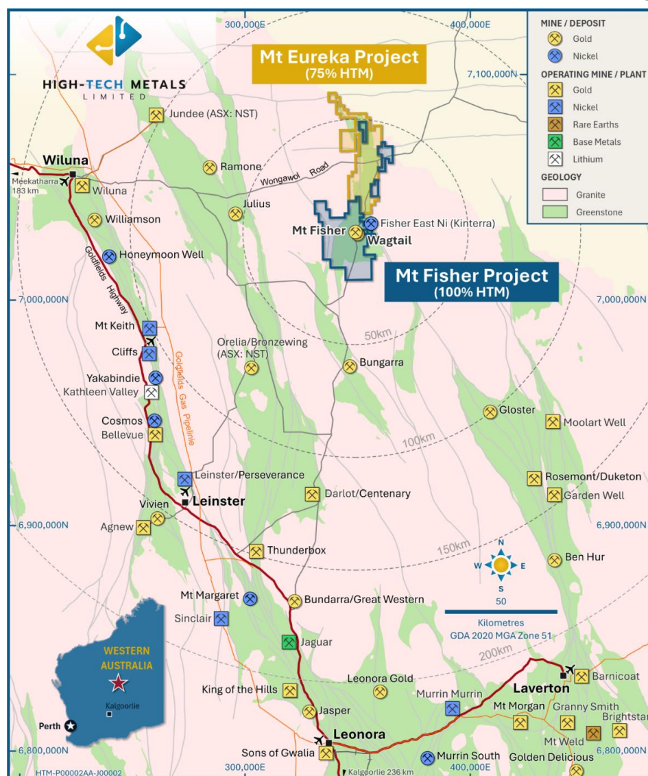
Figure 4: HTM's Mt Fisher and Mt Eureka Gold Project, Northern Goldfields, Western Australia.