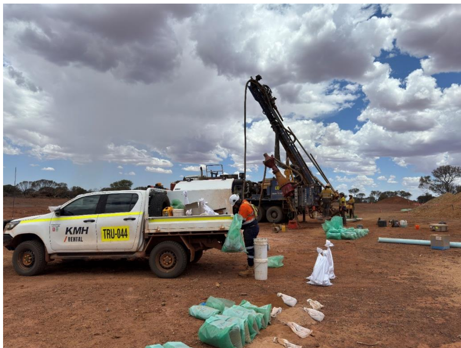
Figure 3: SSH geologist logging drill chips at Wagtail, December 2025.

In relation to the disclosure of visible mineralisation, the Company cautions that visual estimates of mineral abundance should never be considered a proxy or substitute for laboratory analysis. Laboratory assay results are required to determine the actual grade of the visible mineralisation reported in preliminary geological logging. The Company will update the market when laboratory analytical results become available, expected in January 2026.