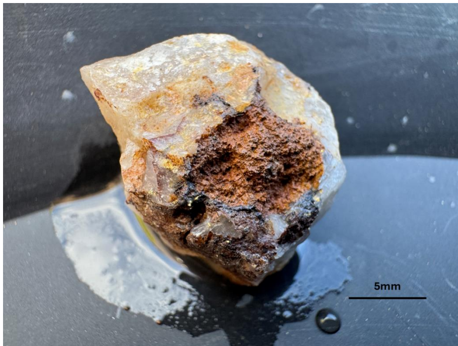
Figure 2: Visible gold in a quartz-sulfide (goethite after pyrite) vein, 25WTRC014 from 33-34m.

In relation to the disclosure of visible mineralisation, the Company cautions that visual estimates of mineral abundance should never be considered a proxy or substitute for laboratory analysis. Laboratory assay results are required to determine the actual grade of the visible mineralisation reported in preliminary geological logging. The Company will update the market when laboratory analytical results become available, expected in January 2026.