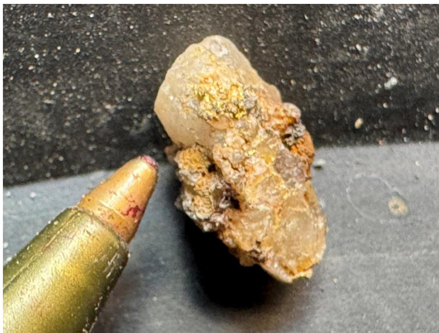
Figure 1: Visible gold intersected in 25WTRC014 from 33-34m (approximate size of fragment is ~10mm)

"SSH has developed a strong and constructive working relationship with the High-Tech Metals team, with both groups aligned on safely and efficiently advancing the Wagtail deposit. The consistency of mineralisation observed to date, combined with Wagtail's existing mining lease, established infrastructure and proximity to processing facilities, reinforces our view that the deposit has clear potential to be progressed toward a near-term production decision."