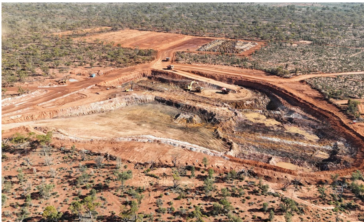
Figure 1: Well-advanced Pre-Strip-Mining activities at Lucky Strike Stage 1 Pit