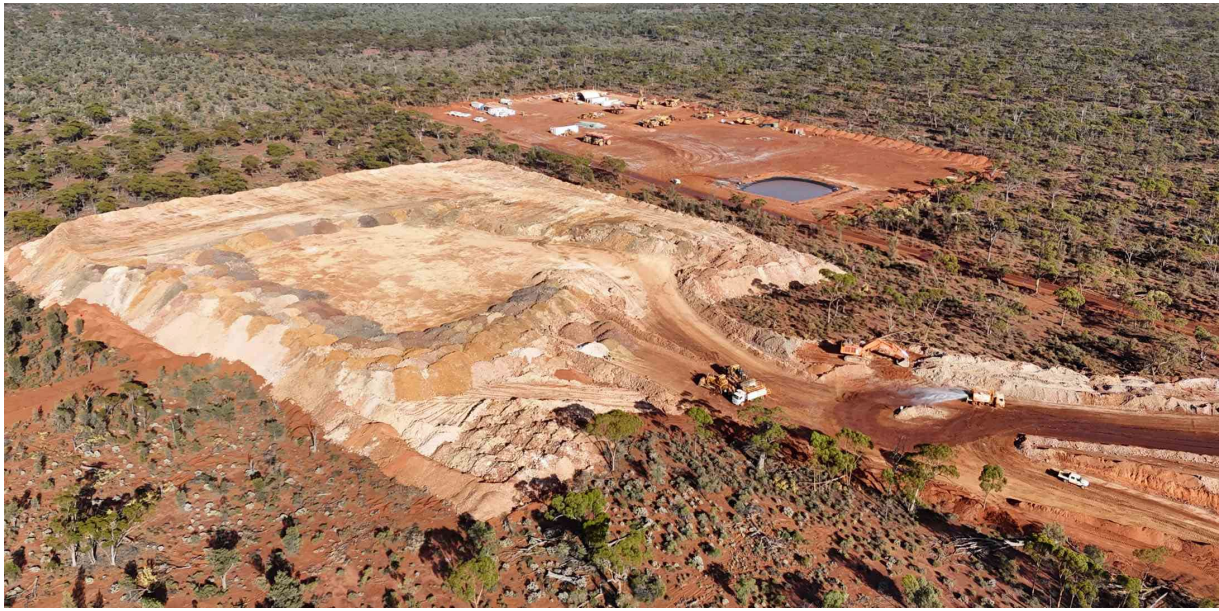
Figure 2: Southwestern Waste Dump (foreground) with ROM Pad and Office Complex (background)

The cash received from this second instalment ensures the Company remains fully funded ahead of profit-share distributions flowing from the Lucky Strike Gold Project in the first half of 2026.