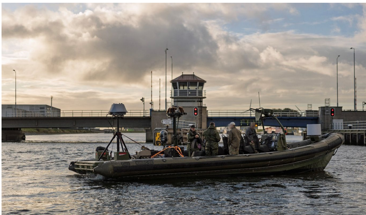
Image: DroneShield DroneSentry-X Mk2 as part of NATO Exercise Bold Machina 25 in the Netherlands