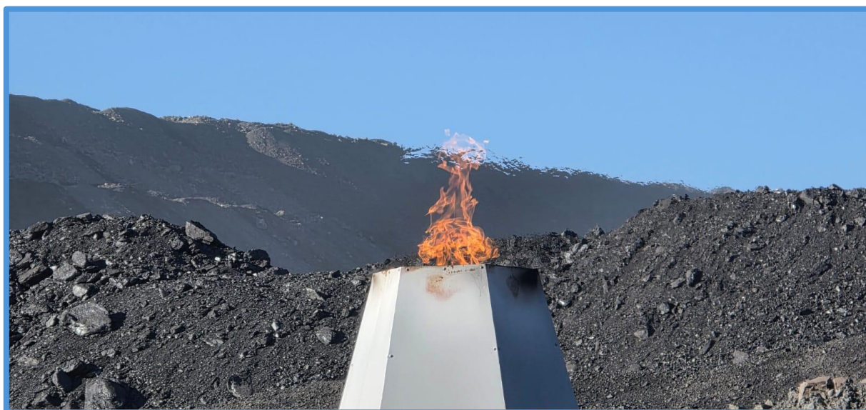
Figure 2: Lucky Fox #4 gas flare adjacent to a coal stockpile