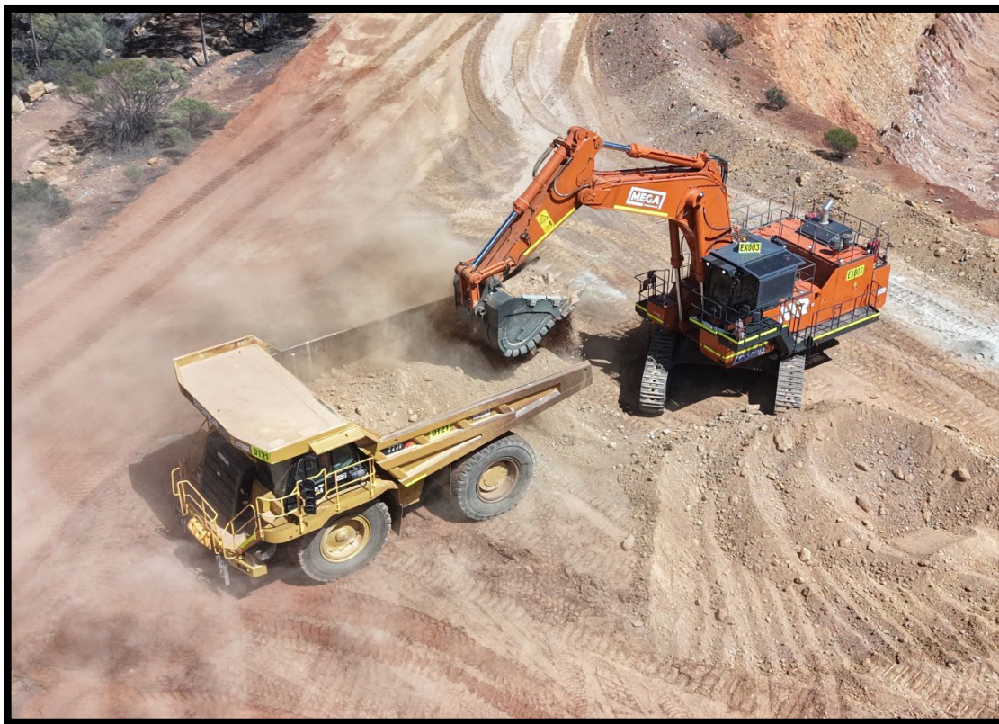
Figure 2: Load and haul operation at Mt Dimer Taipan