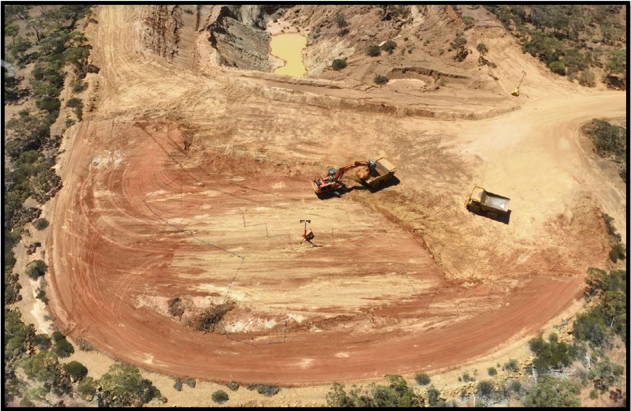
Figure 1: Mining fleet in action at the Mt Dimer Taipan open pit, looking north

Under the October 2025 Right to Mine Agreement (RTMA), MEGA is delivering up to A$18.6 million in non-dilutive capital to advance the project. With site preparations completed and the mining fleet fully mobilised, ore extraction is now progressing on schedule since late November 2025. Toll-treatment at a Kalgoorlie 1 facility (200,000 tonnes per annum capacity) will follow in March 2026, creating a streamlined, fully funded pathway from initial mining, through to processing, and transition into production.