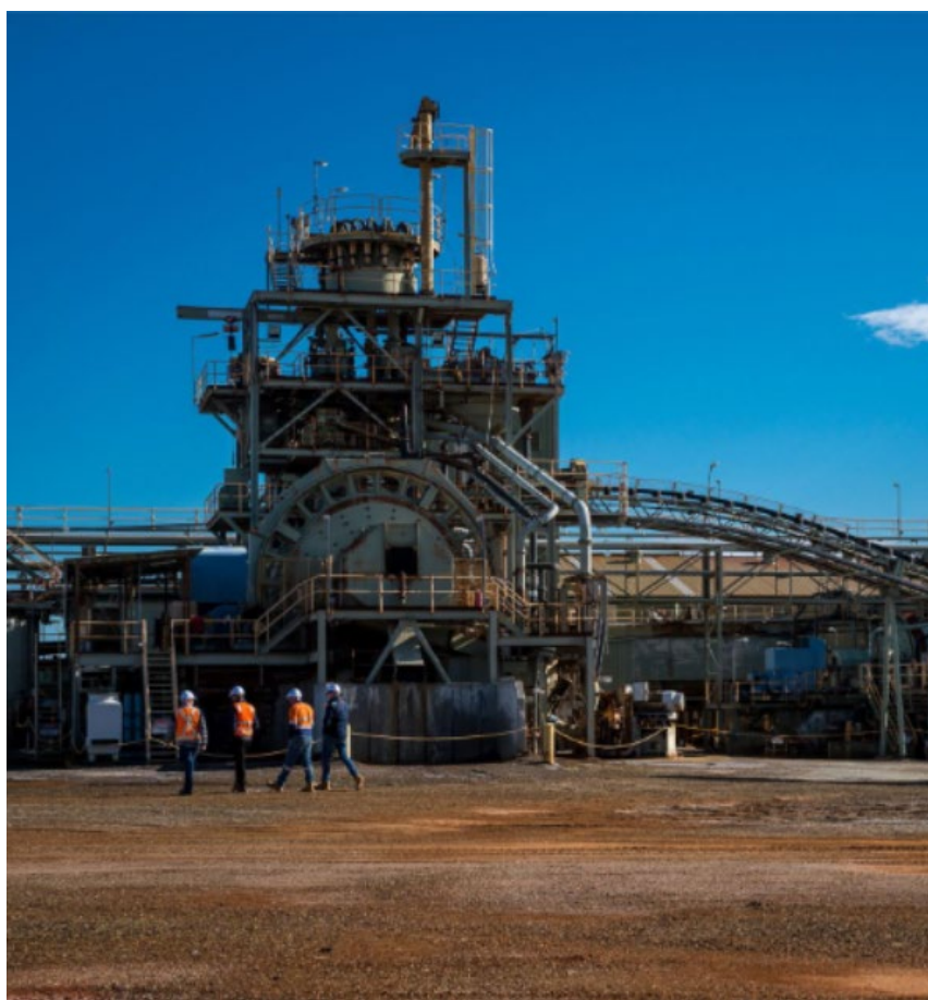
Figure 2. Lake Johnston processing plant.

The facility is currently licensed to operate to 2041, providing a long-term processing base for Forrestania's gold portfolio.