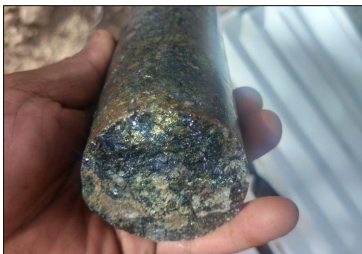
Figure 1. Photograph of exceptionally high grade silver and gold-bearing sulphide mineralisation in new Yoquivo drill hole YQ-25-009 at 322.7m down hole. This sample returned 0.67 metres at 5,739g/t AgEq 1 (2,780g/t Ag & 38.6g/t Au) from 322.58m.