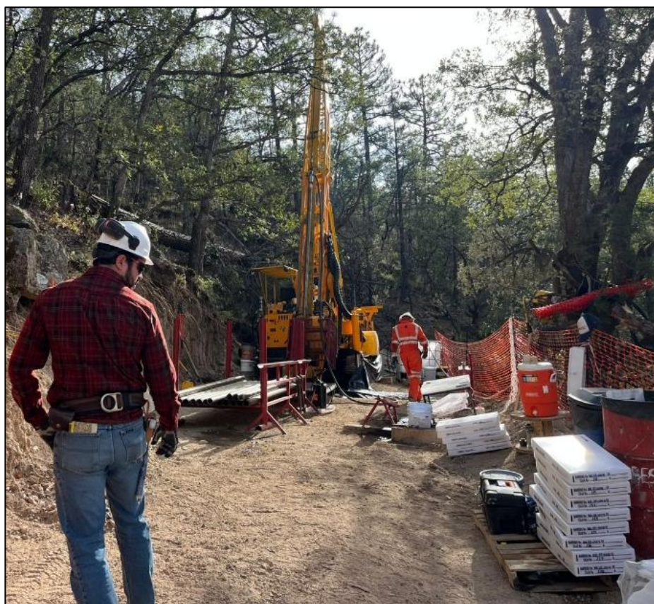
Figure 2. Photograph of the diamond rig set up and drilling hole YQ-25-009 in the central portion of Pertenencia at Yoquivo.

YQ-25-009 0.3m at 1,120g/t AgEq - 790g/t Ag & 4.3g/t Au from 115.8m 2.43m at 203g/t AgEq - 159g/t Ag & 0.6g/t Au from 129.82m incl. 1.03m at 366g/t AgEq – 287g/t Ag & 1.0g/t Au from 129.82m 2.05m at 512g/t AgEq - 325g/t Ag & 1.0g/t Au from 138m 14.1m at 320g/t AgEq - 167g/t Ag & 2.0g/t Au from 309.9m incl. 1.5m at 2,663g/t AgEq – 1,331g/t Ag & 17.4g/t Au from 321.75m 1.2m at 385g/t AgEq - 267g/t Ag & 1.5g/t Au from 377.6m