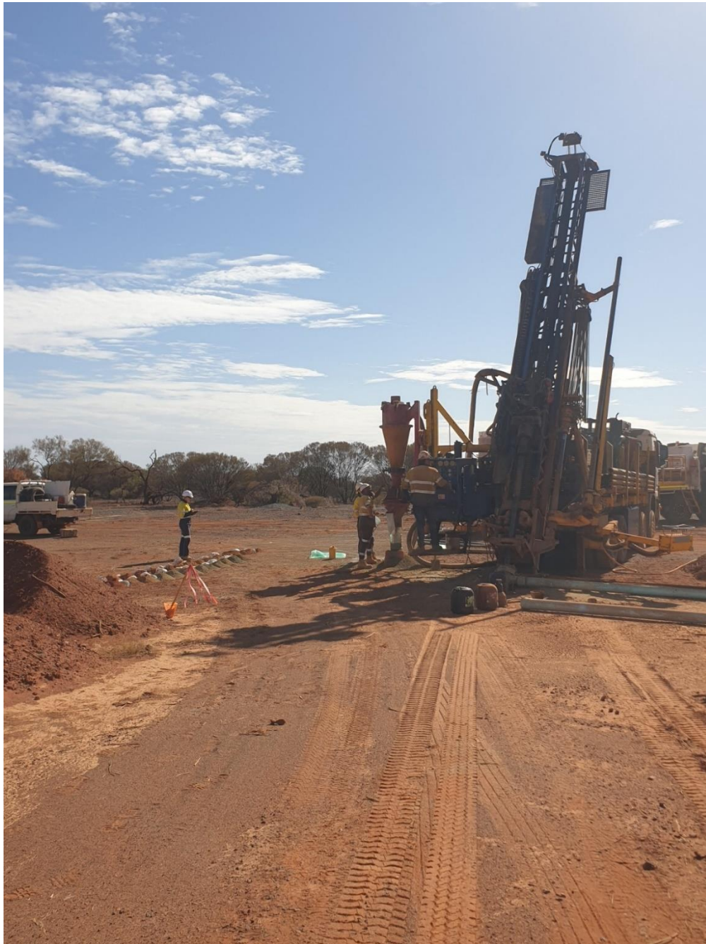
Figure 1: Drill rig onsite at HTM's Wagtail deposit, January 2026.

"The recommencement of drilling at Wagtail enables completion of the planned infill and grade-control metres across mineralised zones, improving geological confidence and confirming continuity while generating representative datasets to directly support mine planning, metallurgical testwork and development studies. This disciplined, execution-focused drilling is fundamental to establishing schedules, cost assumptions and engineering decisions, and SSH Mining remains closely aligned with High-Tech Metals in advancing Wagtail through the next stage of evaluation while systematically reducing technical risk."