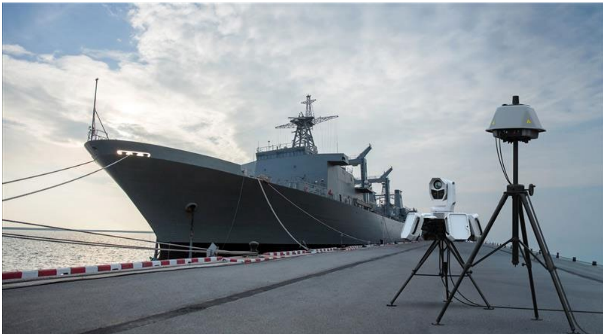
Image: DroneShield's DroneSentry rapidly deployable fixed-site C-UAS solution

The Panel is available for Defence as a means of engaging domestic site planning and support services.