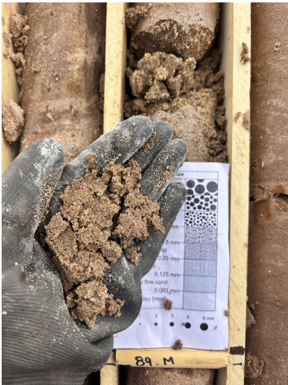
Figure 5. From 89 m to 101m the lithology consists of dark brown medium sands, with sub-rounded grains (~80% quartz) and high visual porosity .