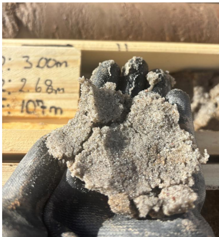
Figure 4. 107–110.5 m : Well-sorted medium to coarse greyish sands, clast-supported, no HCl (carbonate) reaction, high visual porosity. Interpreted as active high-energy fluvial channel or distal alluvial fan deposit, indicating excellent pore connectivity and minimal lacustrine influence.

The units transition from poorly sorted blackish medium to fine sands, fine-sand matrix, carbonates, moderate porosity interpreted as distal fluvio-deltaic or reworked sheet-flood deposits in a lacustrine setting then with finer grain clay units then back to sandy units which was probably a function of depth of water and high and low energy sequences of water flow.