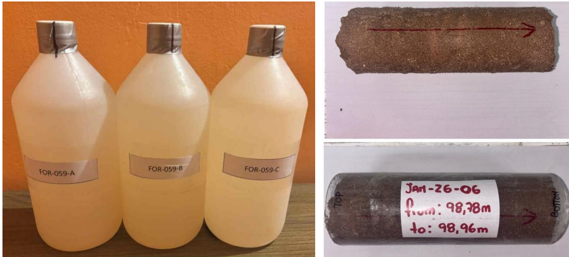
Figure 3. Brine samples from 98-103m packer test ready to be sent for assay and core sample for porosity test.

The PQ diameter steel casing was installed to 100m depth to stabilise the borehole walls. This will be taken out later and replaced with slotted PVC to enable brine to be pumped.