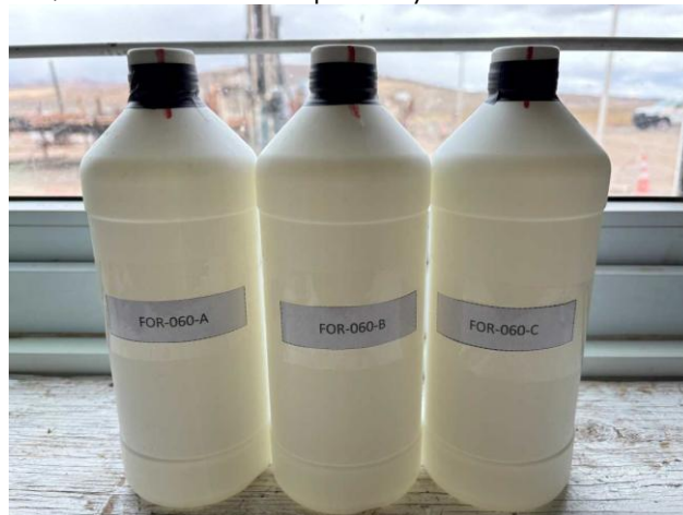
Figure 1. Core extracted at 129.4m ready for porosity testing and bottles of brine from Packer test ready for assay.