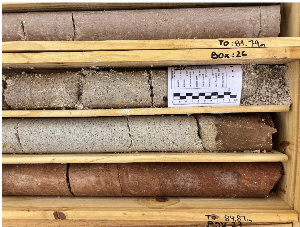
Figure 2. Lithological transition between volcaniclastic black medium sands with mafic minerals and ignimbrite.