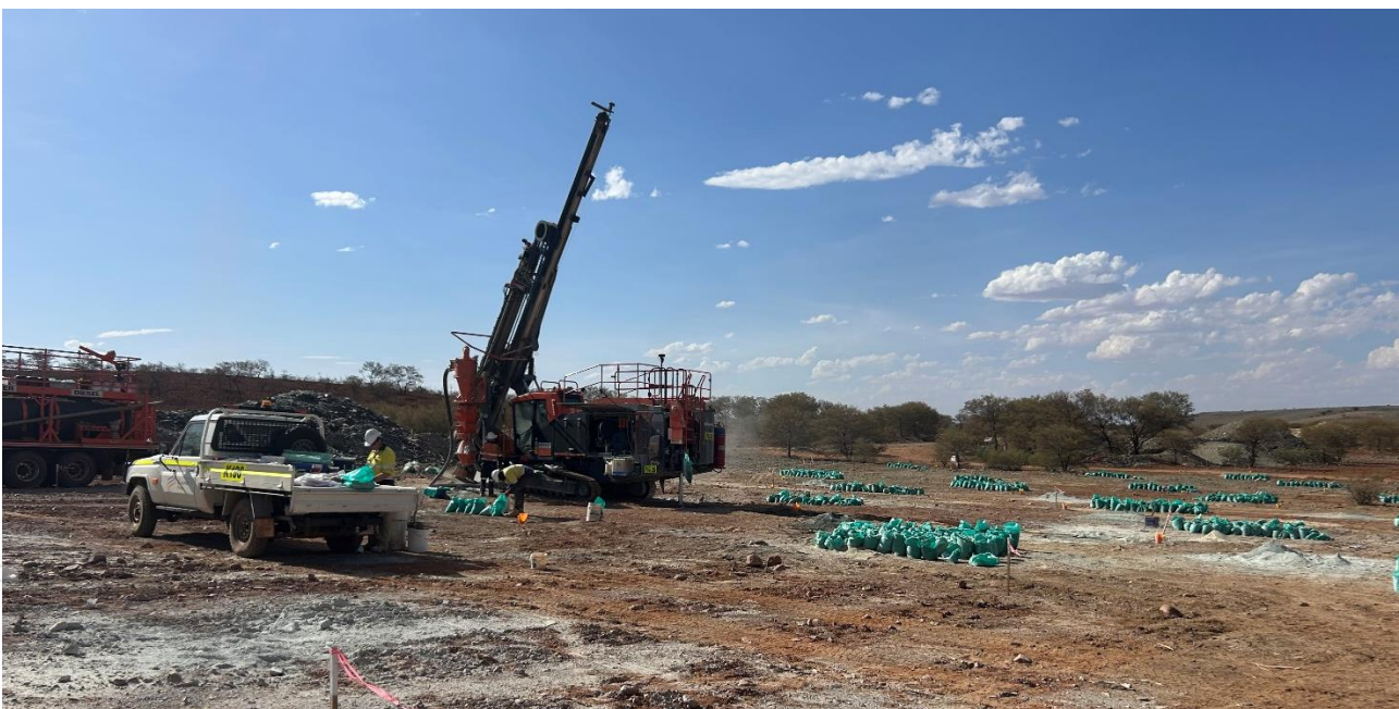
Figure 2 - Grade Control Drilling Underway at the Tumblegum South Gold Project

Grade control drilling is currently underway at the project site, with 611 metres of the ~4,000 metres completed during the quarter. 8 MEGA Resources is coordinating the drilling program which will provide data to define the mining production schedule. The closely spaced holes will be used to guide the mining process.