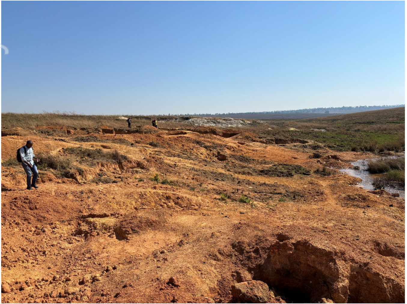
Figure 2. The Consito Alto garimpo workings.