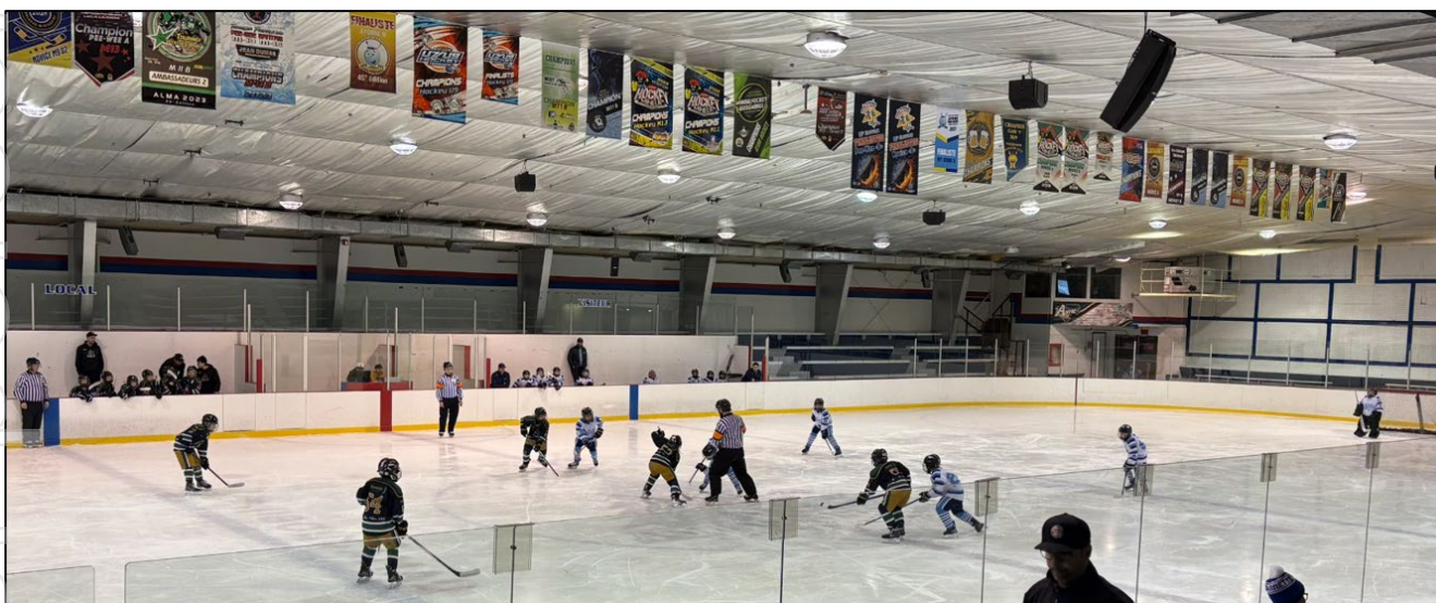
Figure 3: Sponsorship of local Ouje Bougoumau / Chibougamau youth hockey team "Ambassadeurs".

Cygnus has continued to actively support First Nations and community activities. This included participation in various positive meetings with First Nations and community representatives as part of the drilling and environmental permitting process and regarding the Company's plans over the rest of the year.