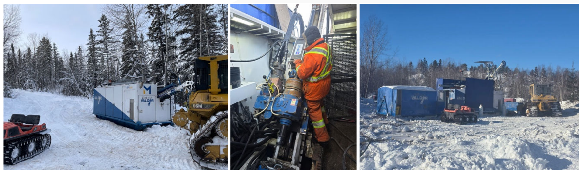
Figure 1 –Drill rig mobilisation & set-up at the Rouyn Gold Project – Astoria Project Area, Québec.

“Commencing drilling at Rouyn marks an important milestone for the Company. This 15,000 metre Phase 1 program has been carefully designed to systematically test priority targets, beginning with Astoria, which we see as a key growth area within the broader Rouyn mineralised corridor. We are pleased with the strong on-ground execution to date, supported by our experienced Québec-based team and contractors. With the rig now turning, we look forward to delivering a steady flow of results to the market as the program progresses.”