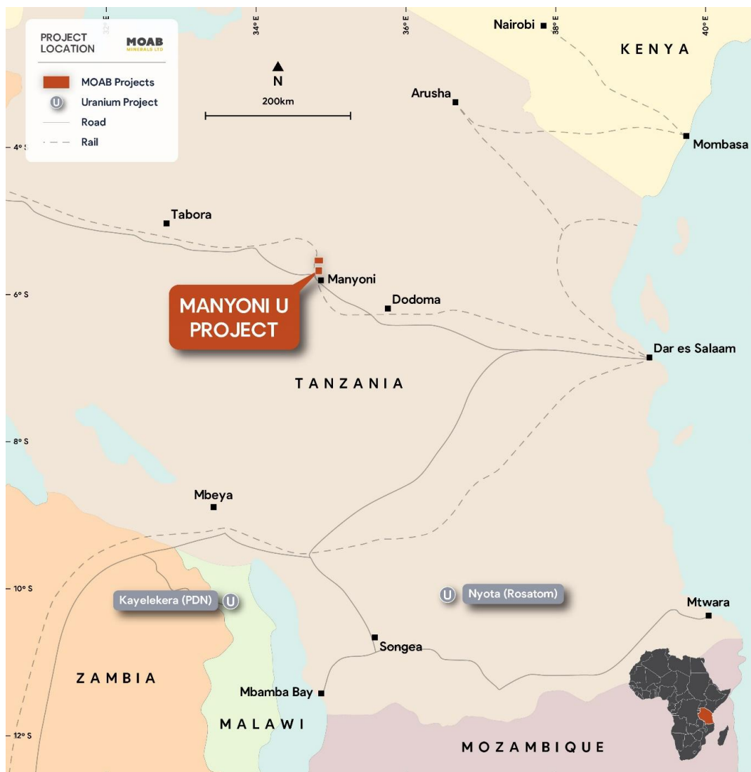
Figure 1. Location of Manyoni Uranium Project in Tanzania

Moab will also continue to evaluate other resource opportunities as they arise.