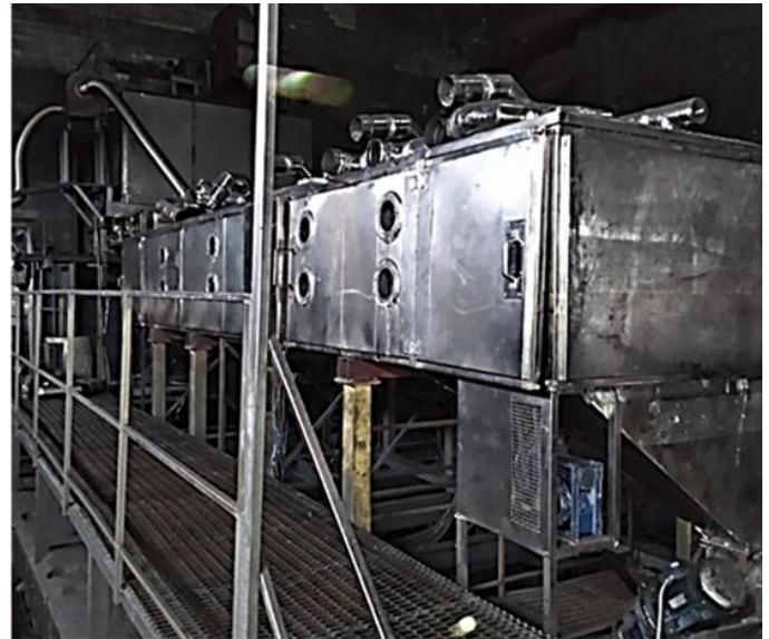
Figure 1: Zavalievsky Graphite purification circuit used to produce 99.5% HPG in Ukraine.