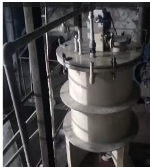
Figure 2: Small-scale reactor commissioned at ZG facility to produce UHPG.