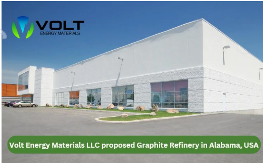
Figure 3: VEM Proposed Alabama Graphite Refinery Concept Drawing