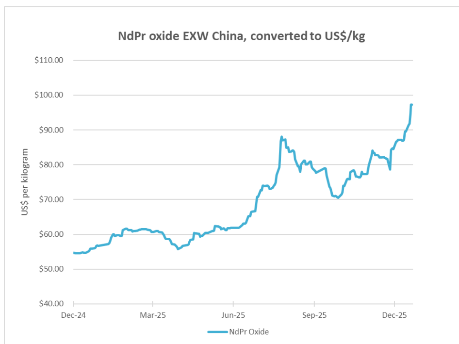
Figure 1: Asian Metals NdPr Oxide Price EXW China (inclusive VAT) converted to US$

Following China's announcement of its expanded export control list and the heightened trade tensions with the US leading up to the end of the 90-day 10 November 2025 tariff truce, the NdPr price rose from US$70 per kilogram, reaching US$87 per kilogram by year's end. Post December prices continued to increase sharply, exceeding US$100 per kilogram 1 EXW China on 26th January 2026. Price referencing agencies are continuing to report a significant premium for Ex-China trade of magnet rare earth oxides with NdPr at a consistent 10% premium, whilst dysprosium and terbium are reported at 4-5 times the China domestic traded price.