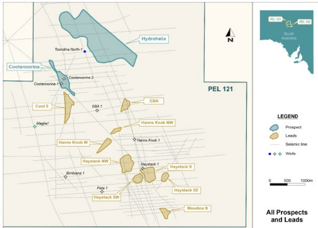
Diagram 1: Arckaringa Project Prospects and Leads

In Australia, D3 Energy continued to progress discussions associated with a potential farm-out of the Hydrohelix prospect in the Arckaringa Basin. Engagement with prospective partners focused on funding structures and potential participation in future drilling activities.