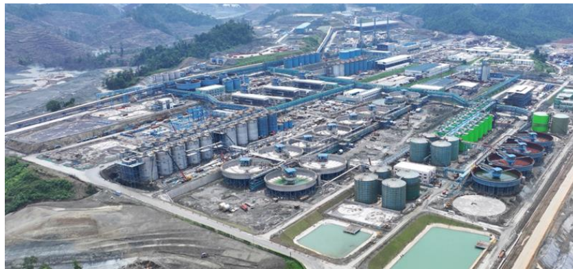
ENC HPAL Smelter

Nearby at the Refinery, standalone unit testing is complete and wet commissioning equipment has been set up in anticipation of final commissioning of end-to-end nickel cathode production. Installation of crystallisers to produce nickel and cobalt sulphates has been completed and integration with the rest of the circuit continues. The Refinery is expected to ramp up production once the HPAL smelter commences commissioning later this quarter.