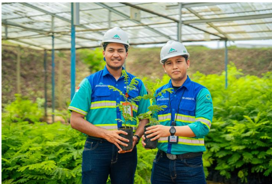
Hengjaya Mine revegetation nursery

During the quarter, 6,400 hectares of surface sampling and mapping in the south of the current IUP were completed. This sampling has identified 1,500 hectares with potential nickel laterite for further exploration.