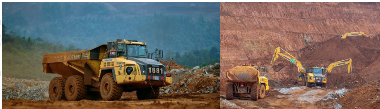
Hengjaya Mine open pit

Adjusted EBITDA loss for the quarter of US$14.9m was significantly lower than the US$32.8m reported in the September quarter, as a result of the delay in the RKAB extension being approved.