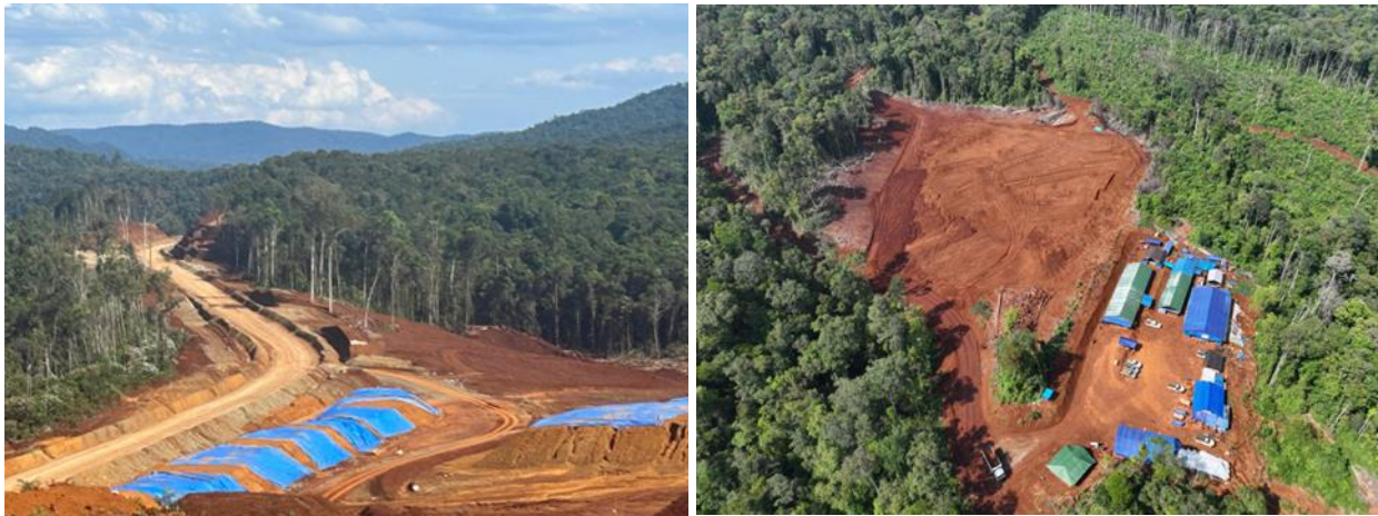
Sampala Mine haul road and accommodation construction

Internal haul roads between ETL and MJN are 72% complete. During the quarter, drill rigs completed 577 drill holes for 18,423 metres. Exploration drilling focused on GF exploration area, with infill drilling programs at the ANN area to support detailed mine planning. In addition to the Resource drilling, the required geotechnical drilling has been completed for mine planning. Drilling programs will continue to focus on resource infill drilling throughout 2026.