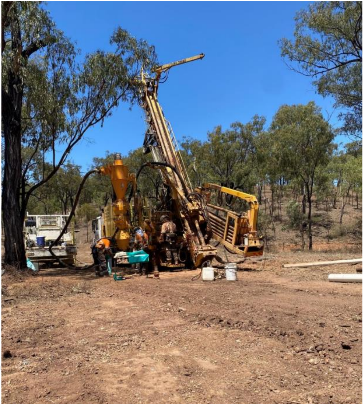
Figure 1 – RC Rig at the Clermont Gold Project in the initial drilling campaign.