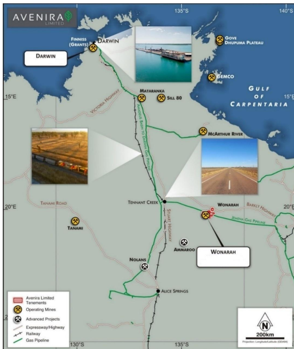
Figure 1: Location map of Wonarah

This model will support evaluation of project phasing, funding requirements and will inform future decision-making as the Company advances toward larger-scale and longer-life operations.