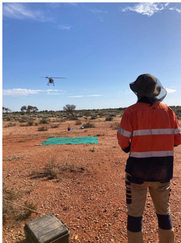
Figure 3 UAV mag survey at Yilganji tenement.