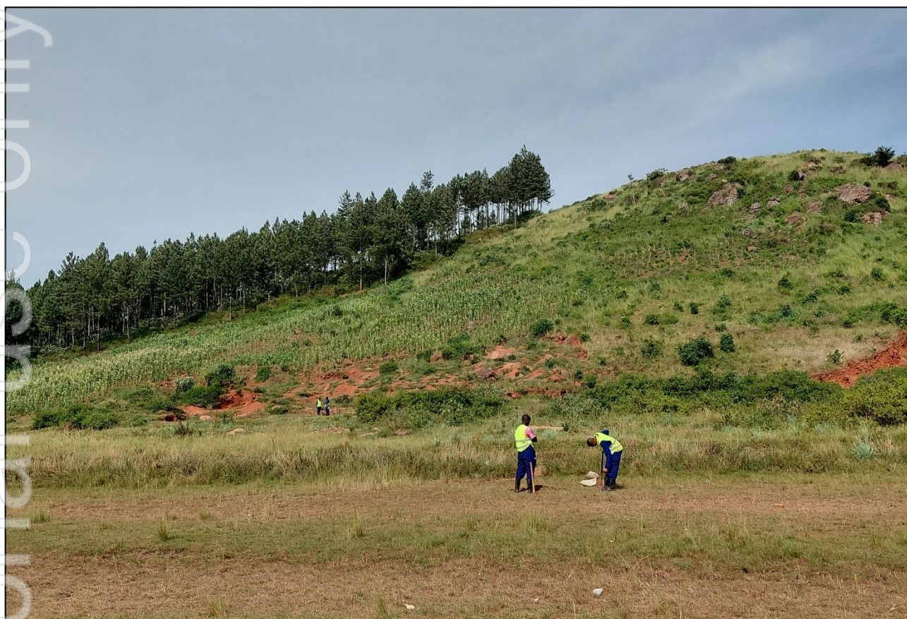
Figure 2: Soil samples being collected on the Busia Project.