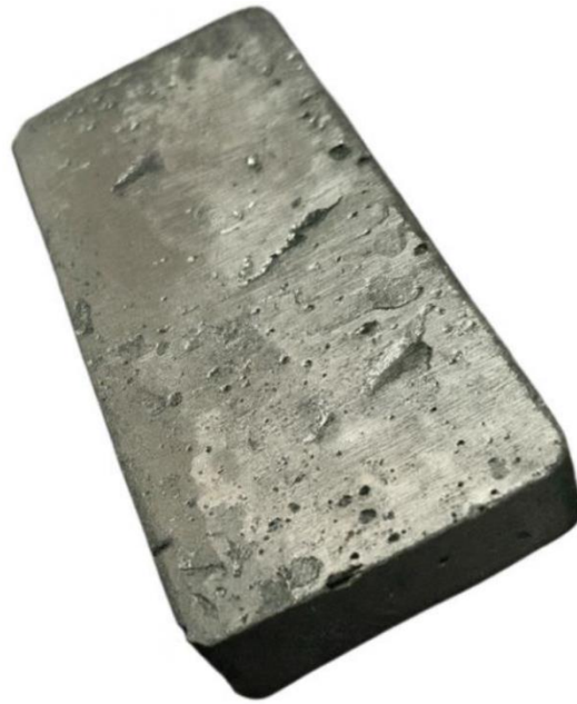
Figure 3: Photo of 100% American made antimony ingot from Mojave

To accelerate these efforts, On 5 November 2025, Locksley executed a Memorandum of Understanding with Hazen Research Inc. to secure processing capacity and expertise for antimony products. The MoU covers validation of process performance, production of product samples (antimony concentrate, oxide and metal) for qualification by potential off-takers and U.S. government agencies, support in designing a pilot and commercial plant, and toll-treatment arrangements to process ore and concentrates during the pilot stage.