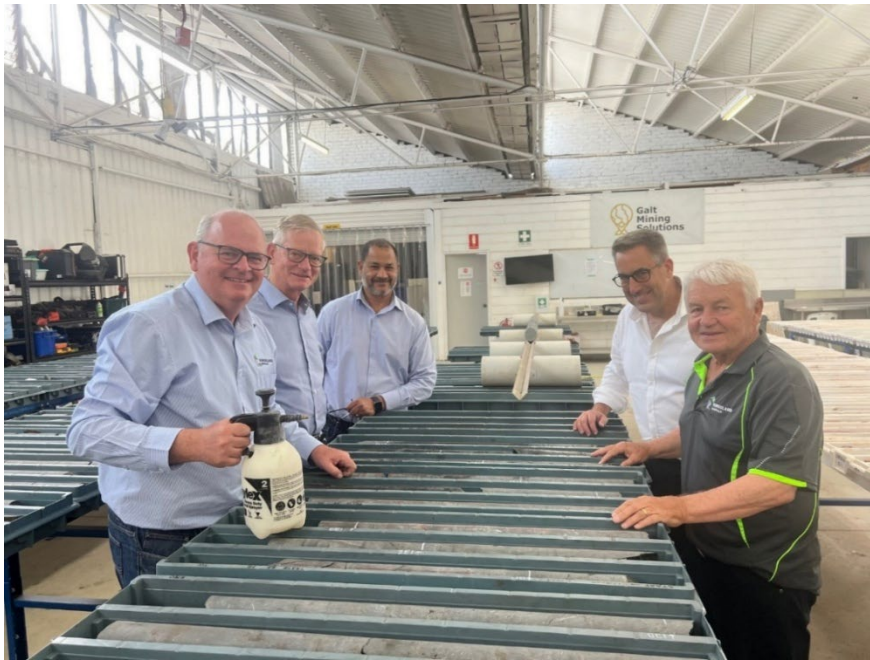
Figure 2: Kingsland Board of Directors inspecting Leliyn drill core at the Galt Mining Solutions facility in West Leederville, Perth