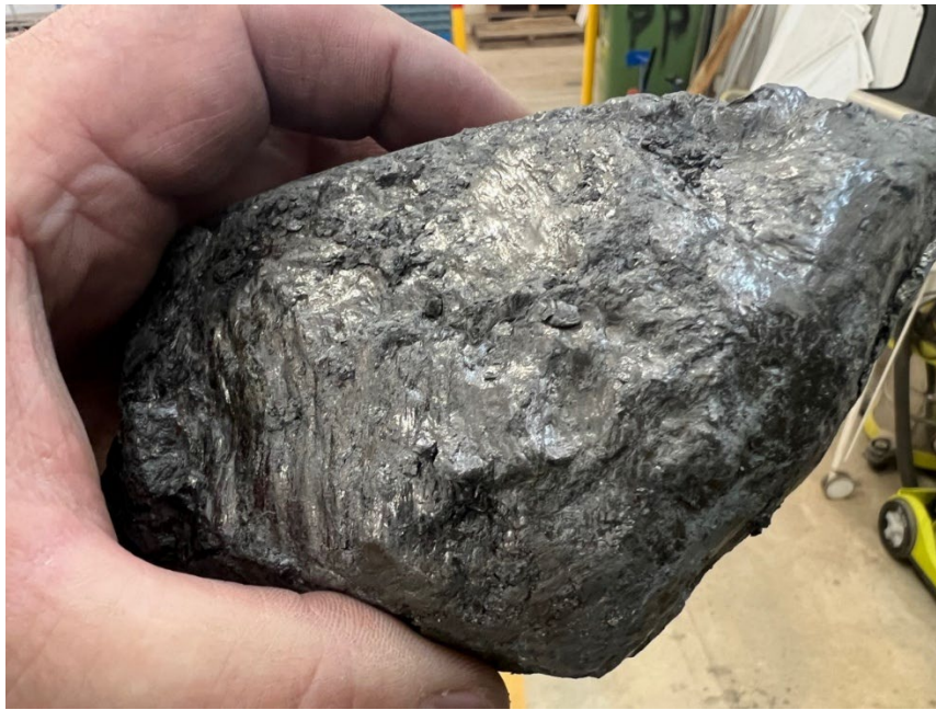
Figure 4: Sample of graphitic schist from LEM002 at 23.6m depth

Figure 4 shows a sample of graphitic schist from the recently drilled LEM002. This hole was collared within 10m of the previously reported LERC_56 that intersected 72m @ 9.21% TGC (from 0m) including 20m @ 13.14% TGC (from 25m). 8 This sample in Figure 4 is visually estimated to contain: