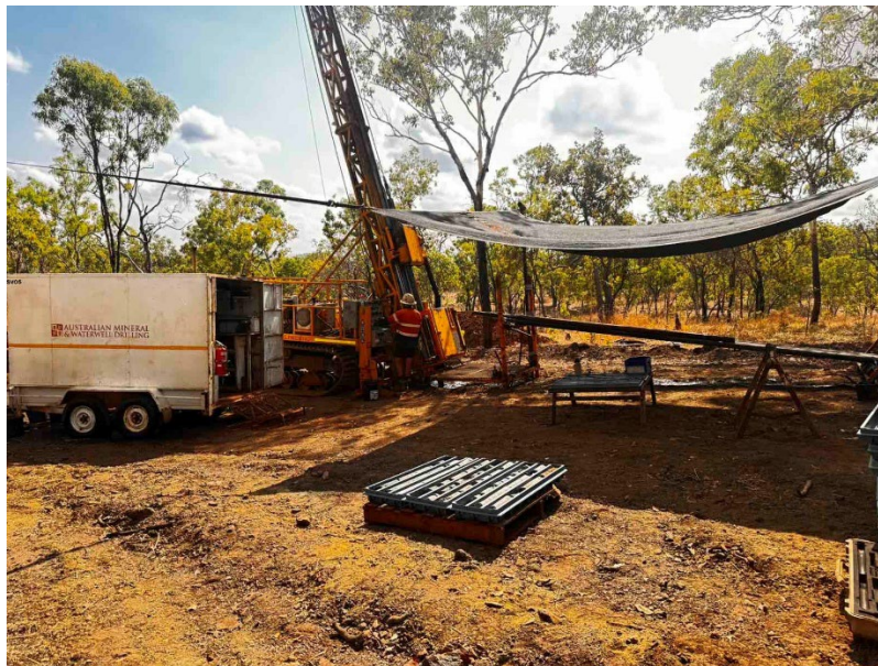
Figure 1: Diamond drilling at Leliyn, October 7 2025

On 7 October 2025, Kingsland commenced a diamond metallurgical drilling program at Leliyn to generate bulk samples for metallurgical test work. The program is designed to collect PQ-sized core for metallurgical test work to support the Pre-Feasibility Study (PFS) and downstream processing studies. 6 A total of 3 PQ size (85mm diameter) diamond drillholes for 379 metres were completed within the Scoping Study pit design (figure 3). 7