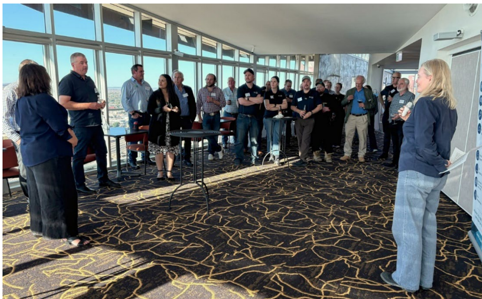
AMEC meeting held in Broken Hill