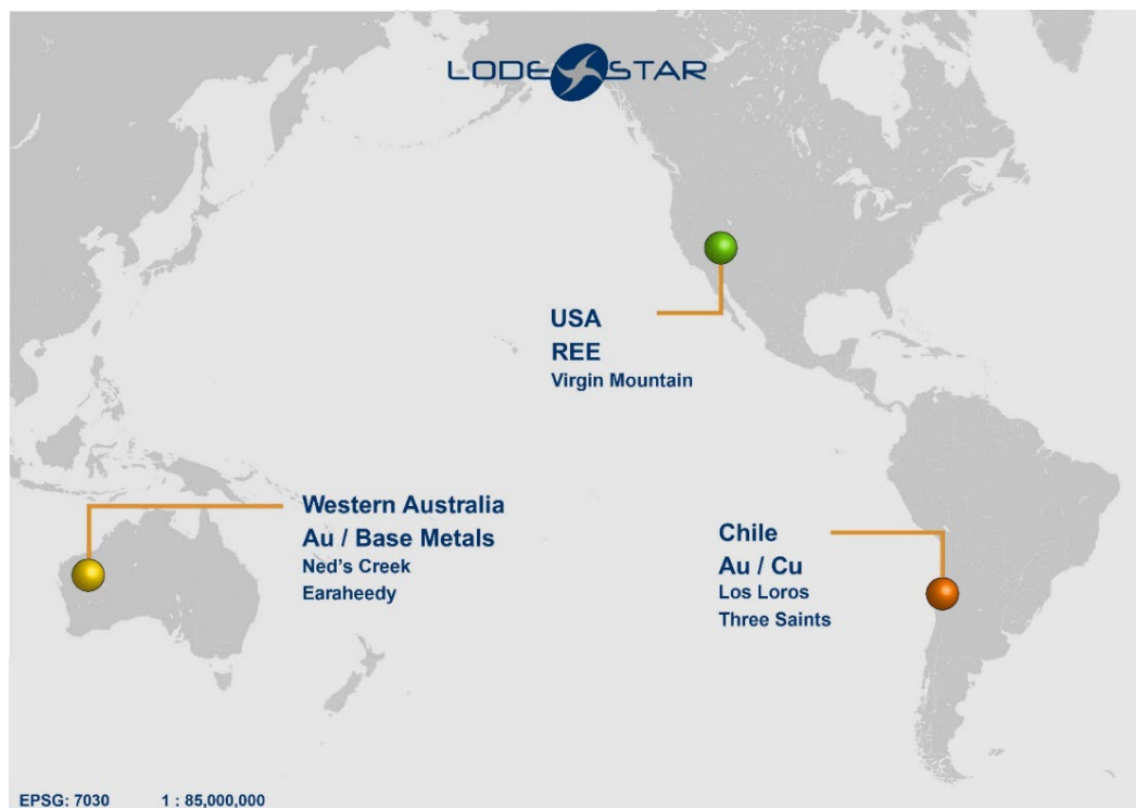
Figure 4: Global map of Lodestar Projects

Lodestar also has exposure to lithium via its 27.5M performance rights in ORE Resources ( ASX:OR3 ) (previously known as Future Battery Minerals, ASX: FBM) who own the Kangaroo Hills and Miriam Projects in Western Australia.