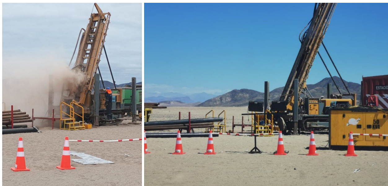
Figure 3: Drilling at Three Saints Project

Drilling has now commenced, with the program expected to continue through the coming weeks, representing an important milestone for Lodestar in one of the world's most prospective copper-gold jurisdictions. The program leverages the Company's growing technical understanding of the region and supports its broader objective of delivering value through systematic, disciplined exploration and we look forward to updating the market on progress and early results from the drill program.