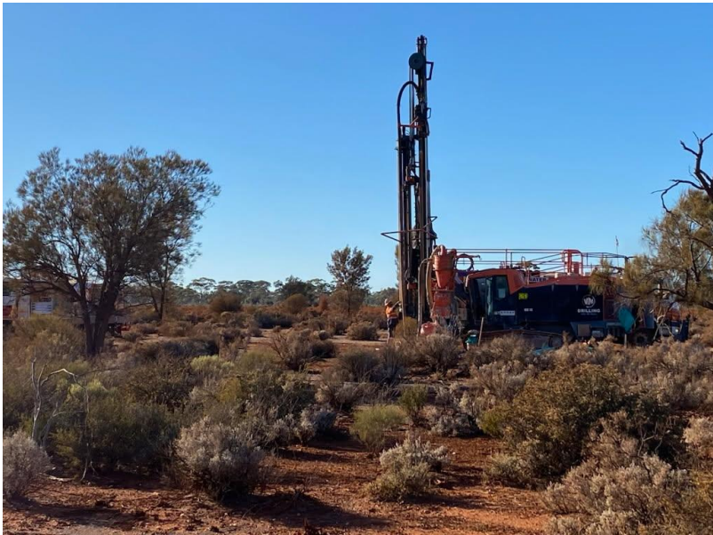
Figure 2: Figure showing the VM Drilling Epiroc ROC L8 track mounted RC rig at the Majestic North gold project.