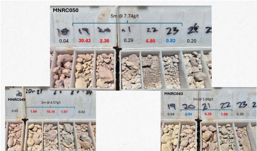
Figure 1: Photographs of the RC chips for holes MNRC043, MNRC049 and MNRC050 showing the assay results for the 1m interval against the logged geology.

Majestic North gold mineralisation is interpreted to comprise a supergene-enriched horizon developed in historic paleochannels above the primary (bedrock) mineralisation. While the current program is focused on infill drilling of these zone to support the upcoming Mineral Resource update, the presence of high-grade intersections at the margin of the supergene envelope is considered relevant in assessing potential for bedrock mineralisation beneath the supergene profile. Follow-up work, including consideration of deeper drilling, will be assessed following completion of the program.