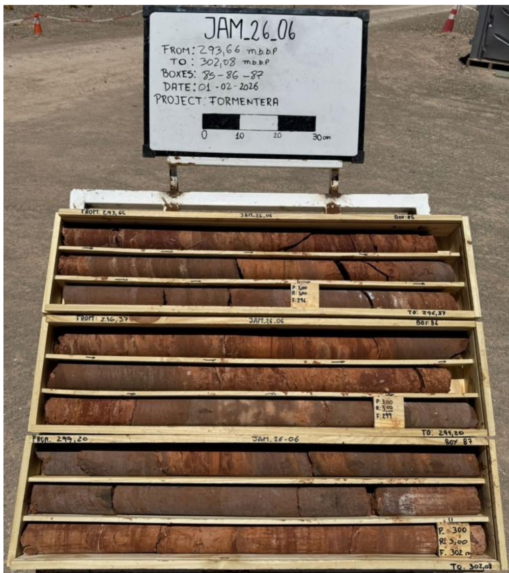
Figure 2. Lithological transition between dominant sand units and occasional fine clay units.