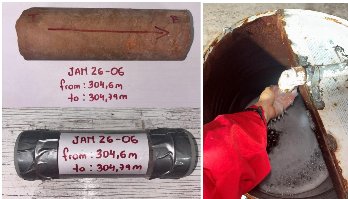
Figure 1. Core extracted at 304.6m ready for porosity testing and brine flowing in packer test ready for assay.