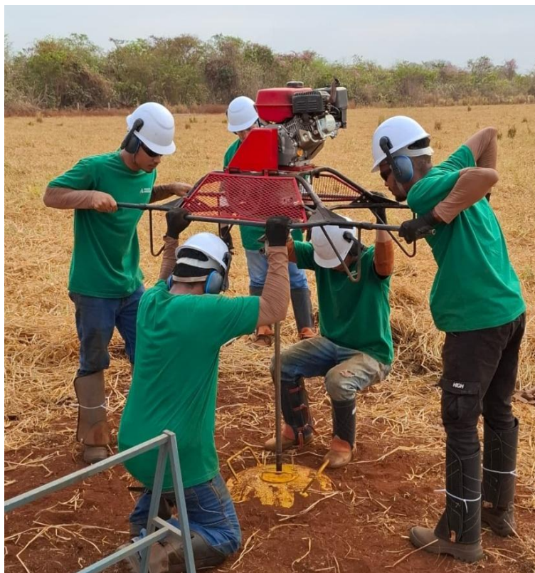
Figure 2. Auger drilling at Santa Anna Project 19 January 2026.