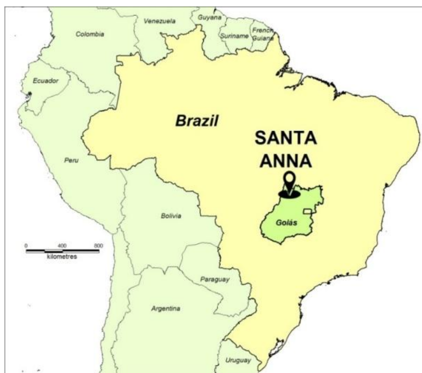
Figure 3. Location of the Sana Anna Project within the Goiás State, central Brazil.