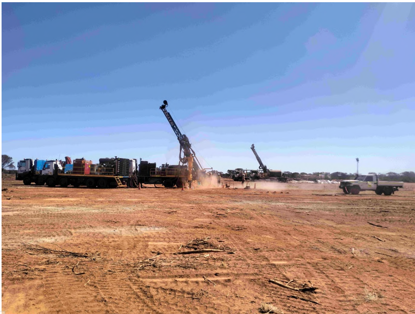
Figure 2, RC and Diamond Drilling onsite at the Swiftsure proposed pit site.

The BFS is expected to be finalised in Q3 2026 and deliver a significantly derisked, high grade and “shovel ready” initial open pit mining scenario with subsequent underground opportunity, subject to final approvals.