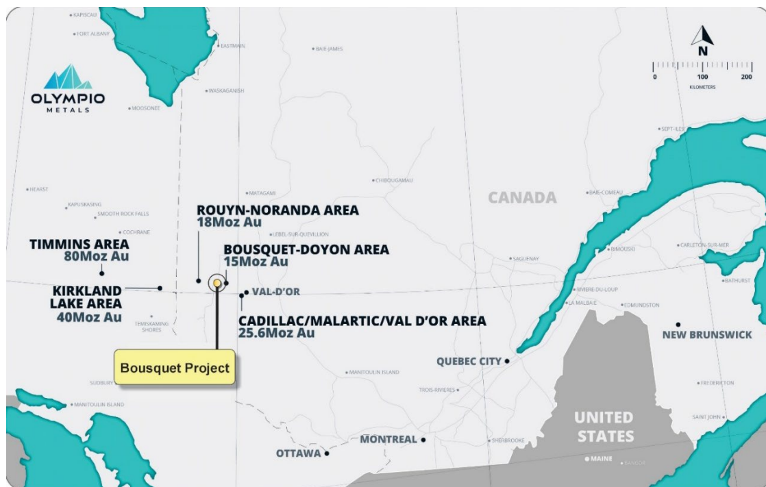
Figure 3: Bousquet Project Location