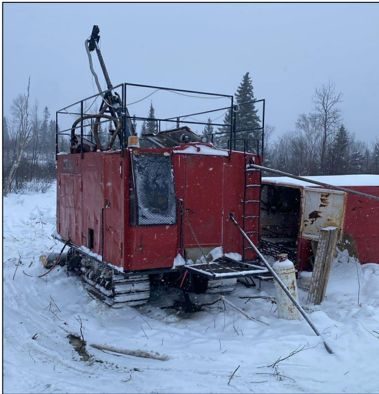
Photo 1: Forage MDion Drill rig on site for second drilling program at Bousquet Project, Quebec.