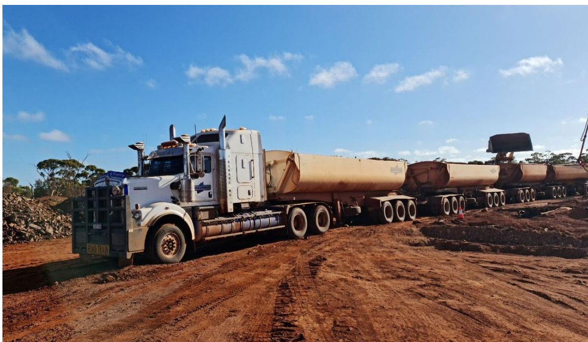
Figure 1: First stockpiles of Lucky Strike Ore being loaded.

Lefroy Exploration Limited (“ Lefroy ” or “ the Company ”) (ASX: LEX) is pleased to report on the Company’s inaugural toll-milling campaign and mining progress at the Lucky Strike Gold Mine near Kalgoorlie in Western Australia.