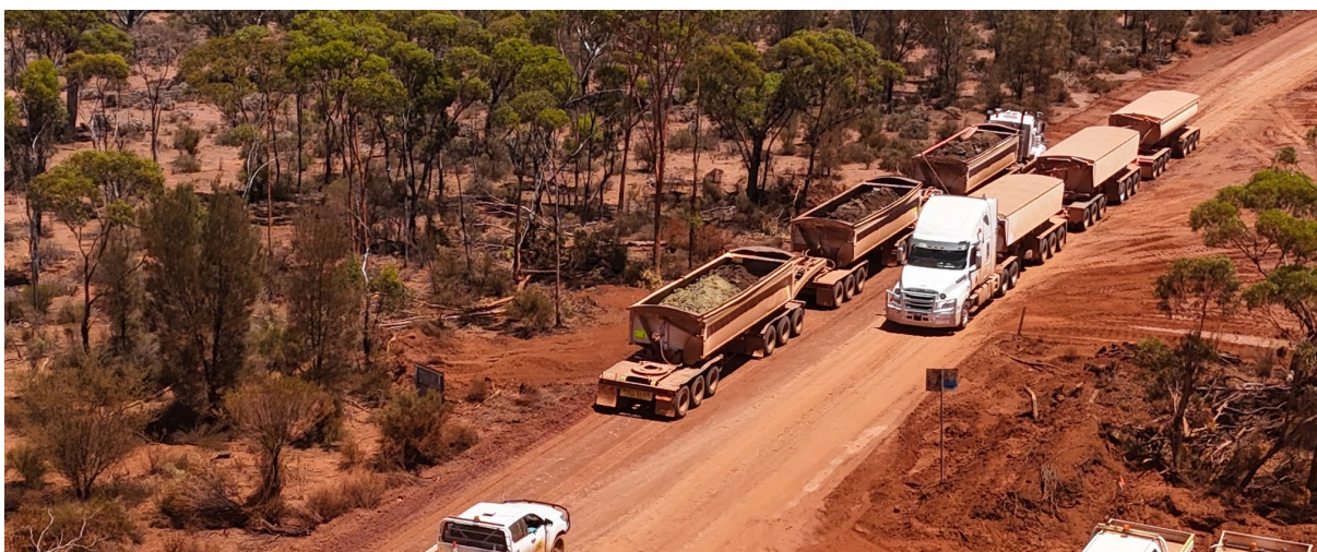
Figure 2: Lucky Strike ore haulage underway to Greenfields Mill (FMR) in Coolgardie

In June 2025, the Company announced that a one-month (February 2026) toll-milling slot had been secured between mine profit share partners BML Ventures Pty Ltd (BML) and FMR Investments Pty Ltd (FMR) utilising the Greenfields Mill in Coolgardie (refer ASX announcement 10 June 2025).