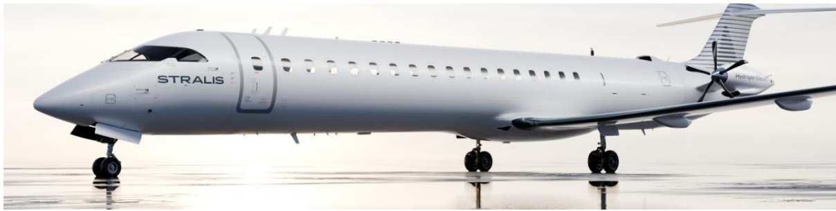
Image: Stralis 30-80 seat aircraft concept

The Company continues to pursue an engineering-led commercial model, working with OEMs, system integrators and industrial partners to support development programs and future production opportunities.