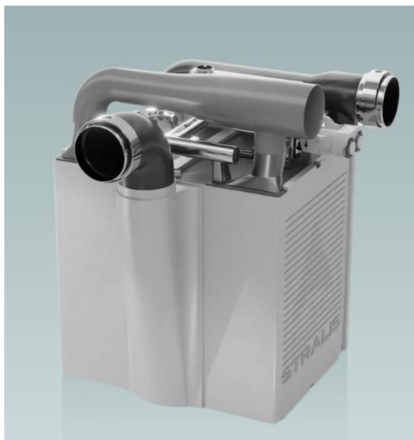
Image: The Stralis HE-120 hydrogen-electric fuel cell system

Sprintex compressors have been integrated into the Stralis H-120 system, supporting fuel cell air management requirements critical to overall system efficiency and performance. This engagement highlights the Company's ability to support emerging hydrogen applications beyond automotive and stationary systems, extending into high-performance sectors such as aviation.