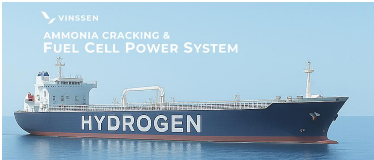
Image: Vinssen maritime fuel cell concept

Sprintex has also supplied fuel cell compressors to Vinssen Co., Ltd., a South Korean developer of hydrogen fuel cell marine and power systems, and Global Nova Co., Ltd., a South Korean fuel cell systems and engineering company. These customers are retained as direct Sprintex accounts under existing arrangements, with production volumes across these programs expected to exceed 200 units per annum.