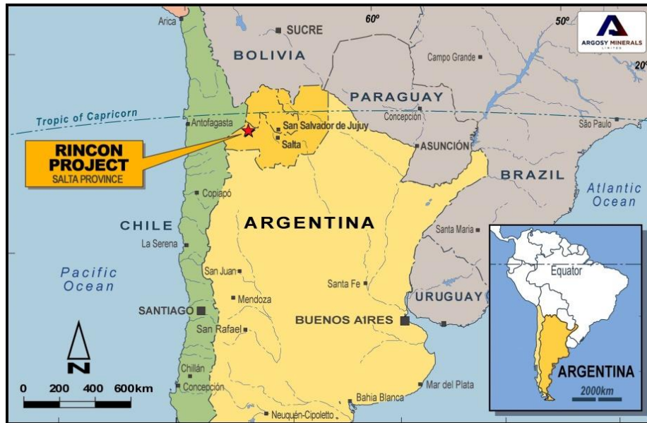
Argosy Minerals Limited – Rincon Lithium Project Location Map

The Rincon Lithium Project is the flagship asset in Argosy's lithium development strategy, and is located within the Salar del Rincon in Salta Province, Argentina, in the world renowned "lithium triangle". The Project comprises up to 8,606 hectares of mining concessions and mining easement right landholdings. The Company has established a well-defined pathway to target commercial production of LCE product.