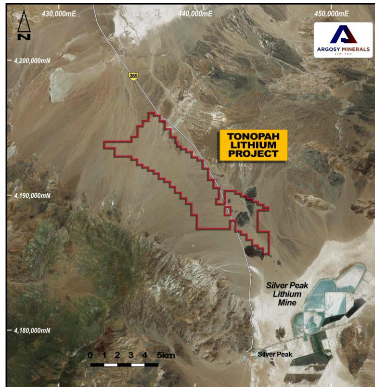
Argosy Minerals Limited – Tonopah Lithium Project Location Map

The Group has a 100% interest in the tenements comprising the Tonopah Lithium Project ('Tonopah'), located in Nevada, USA, which is strategically located near Albemarle's Silver Peak lithium carbonate operation in Nevada, USA.