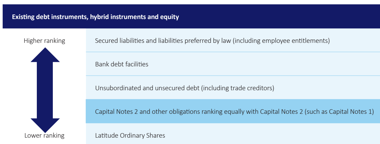
Figure 2: Illustration of how Capital Notes 2 would rank upon a Winding-up of the Company

The Company is the ultimate holding company of the Latitude Group and substantially all its assets are made up of shares in, or other claims on, the Company's subsidiaries. Accordingly, the claims of Holders against the Company will be limited to the value of the Company's residual claims to the net assets (if any) of the subsidiaries, after all liabilities of those subsidiaries have been discharged or provided for.