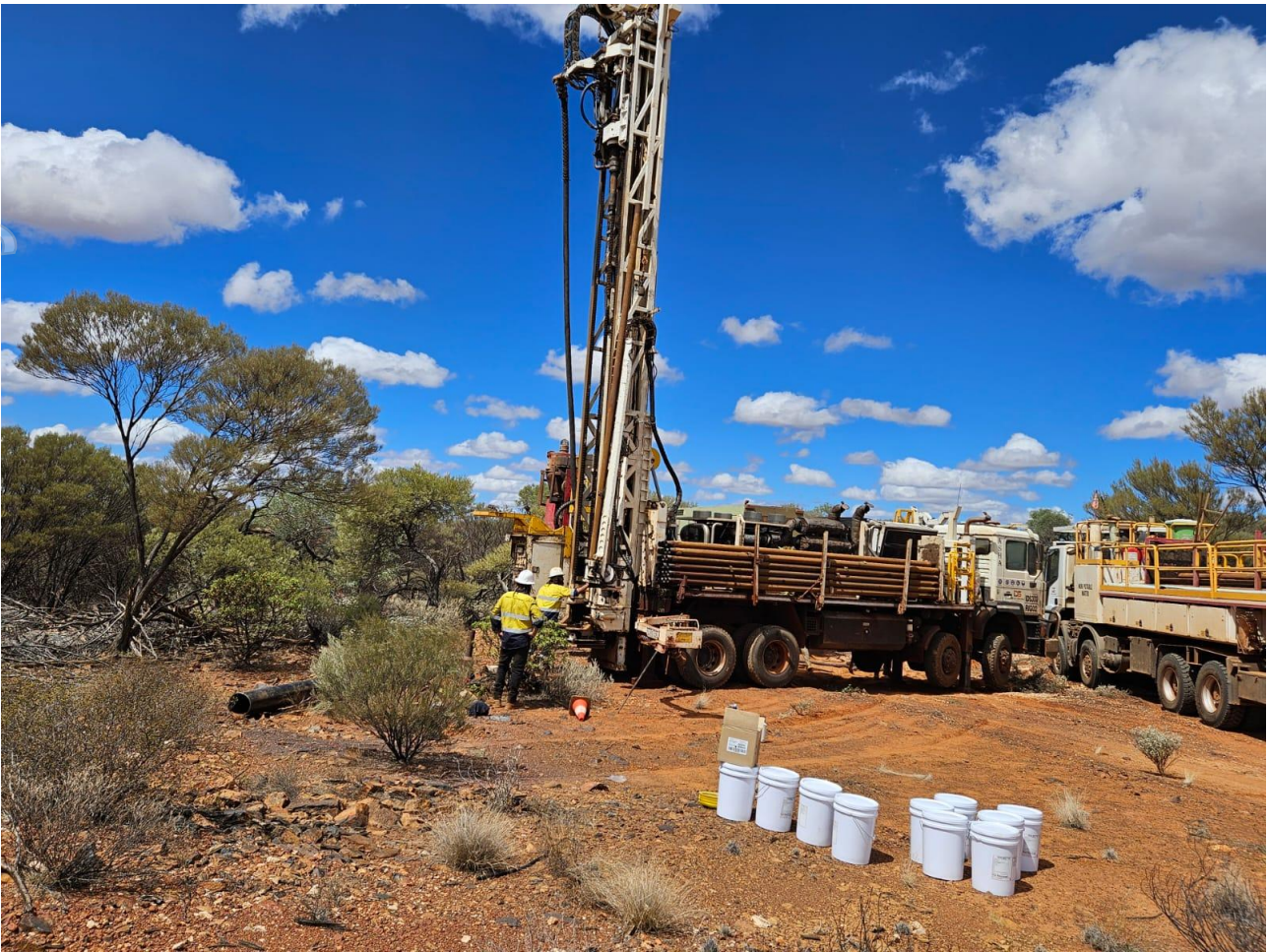
Figure 2: Drilling commenced at the Bowerbird Production Bore within the Gold Duke Project.

The groundwater extraction licence ( GWL213331(1) ) associated with this production bore has been approved by the Department of Water and Environmental Regulation ( DWER ), following the Company's previously announced Pre Mining Works Letter of Award, DWER Approval and Mine Operator Appointed 4 .