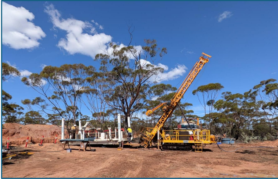
Figure 1: Core Drilling Services DD drill rig on site at New Waverley.