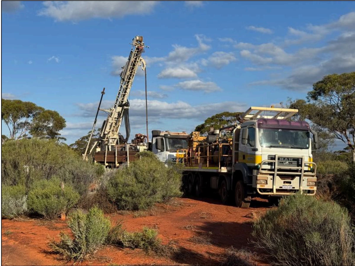
Figure 1. Strike Drilling RC rig at Blair North

Previous results from drilling at Blair North include;