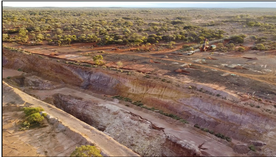
Figure 1: Phase 2 RC drilling below known mineralisation and pre-stripped trial pit at Zelica (M39/1101)