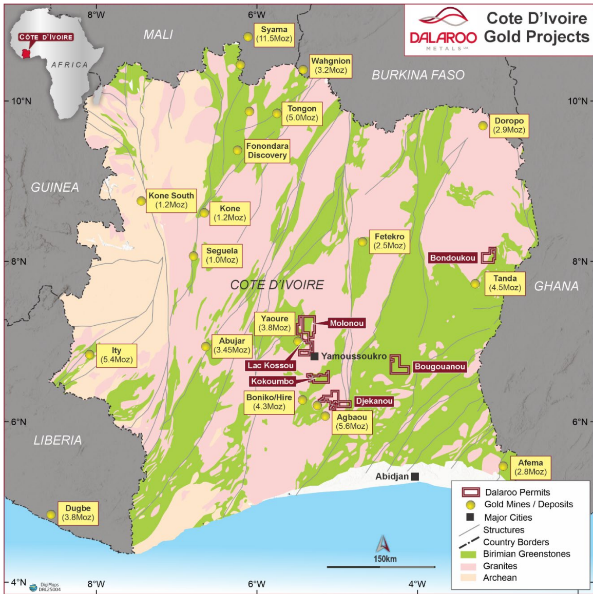
Figure 4. Country scale Map of Cote d'Ivoire showing Dalaroo projects in relation to known gold deposits.