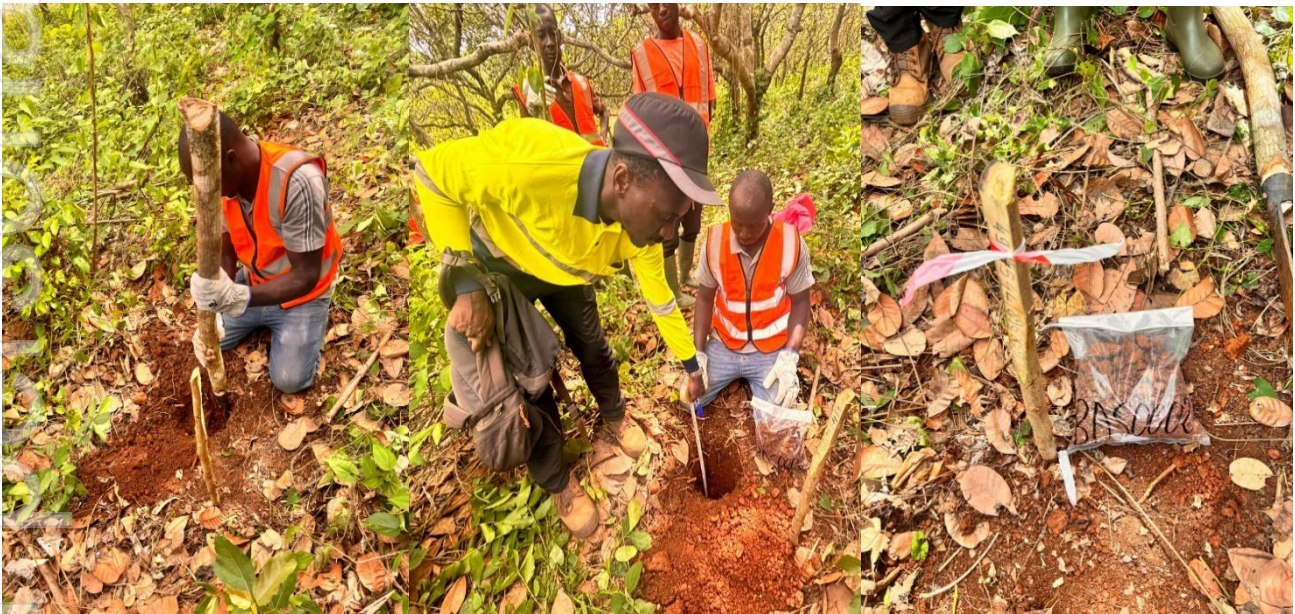
Figure 3. Soil Sampling Field Activities

Representative field conditions and sampling methodology are illustrated in Figure 3 , highlighting consistent sample collection practices and favourable regolith development across the project area.