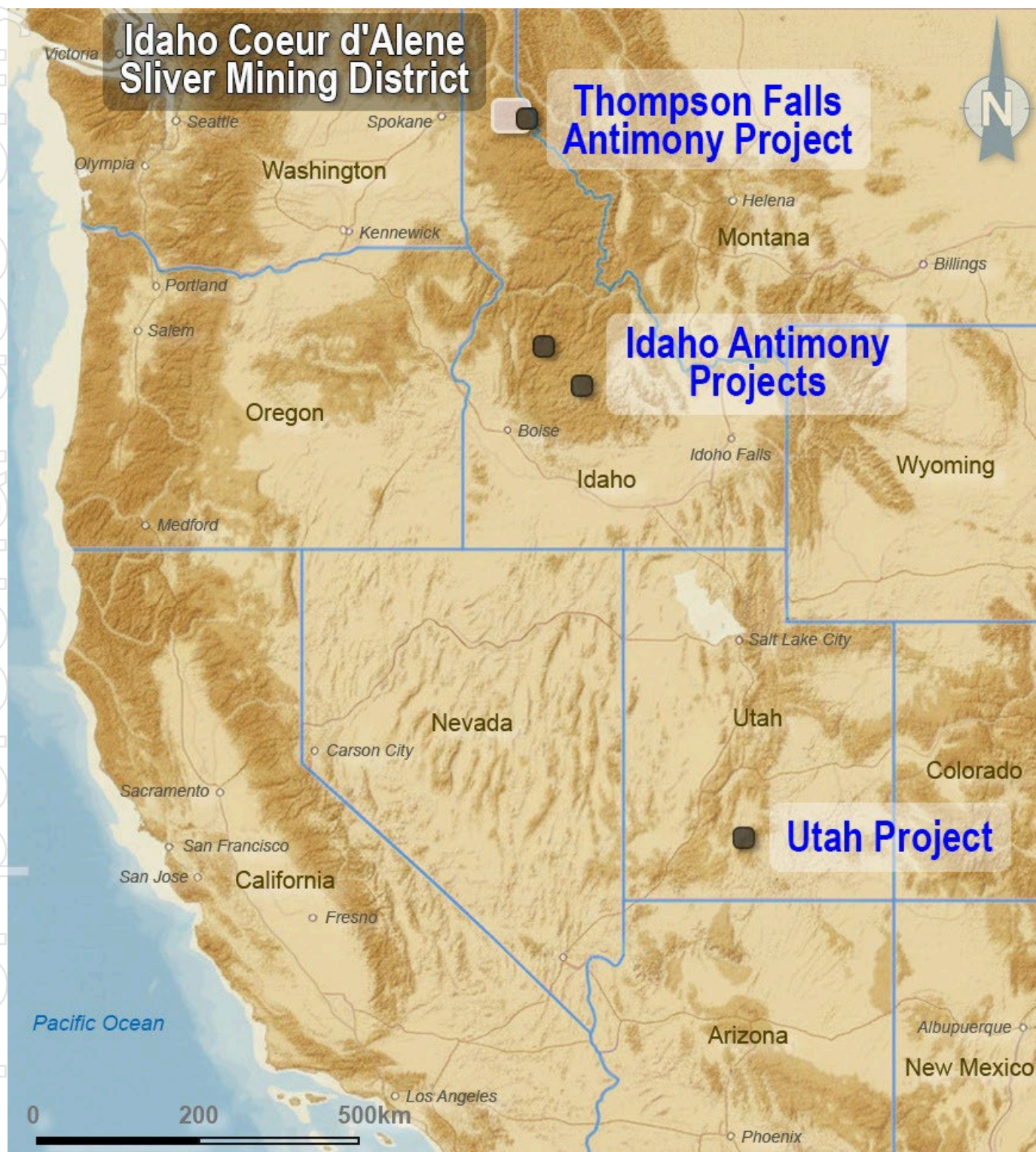
Figure 2: Location of Red Mountain's Thompson Falls, Utah, Yellow Pine and Silver Dollar antimony projects in the Western USA.

immediately surrounding Red Mountain's claims reporting historical assays of up to 85.7 g/t Silver and 17.5 g/t Gold 6 .