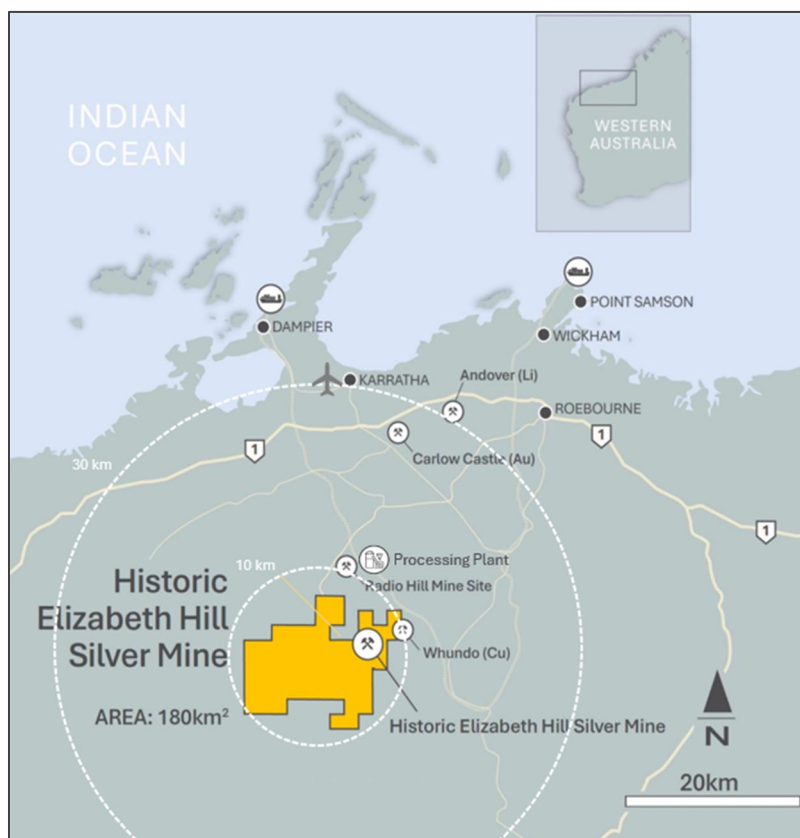
Figure 3: West Coast Silver (WCE) project tenement location

Through the consolidation of surrounding land packages into a single contiguous 180km 2 package, significant exploration and growth potential has been created near mine and regionally. The land package holds a significant portion of the Munni Munni Fault system, and other fault systems subparallel to the Munni Munni Fault system, which are considered prospective for Elizabeth Hill silver deposit analogues.