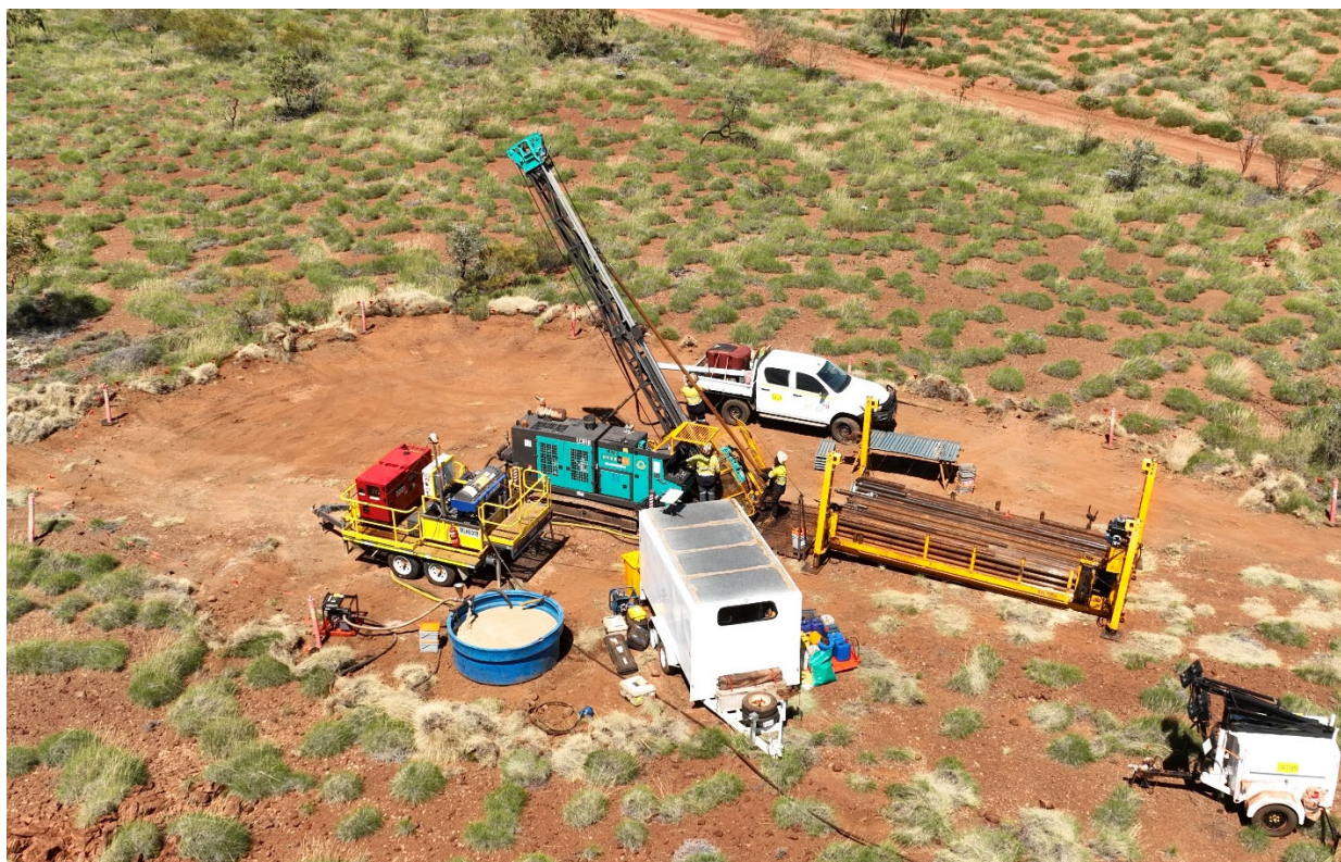
Photo: Diamond drill rig currently at Elizabeth Hill. Drilling in progress.

Focus through the next three months of exploration activities will be on processing, interpreting and reporting results, as well as dynamic repositioning of remaining planned drill holes to maximise chances of success from results received (geological, geophysical and assay results).