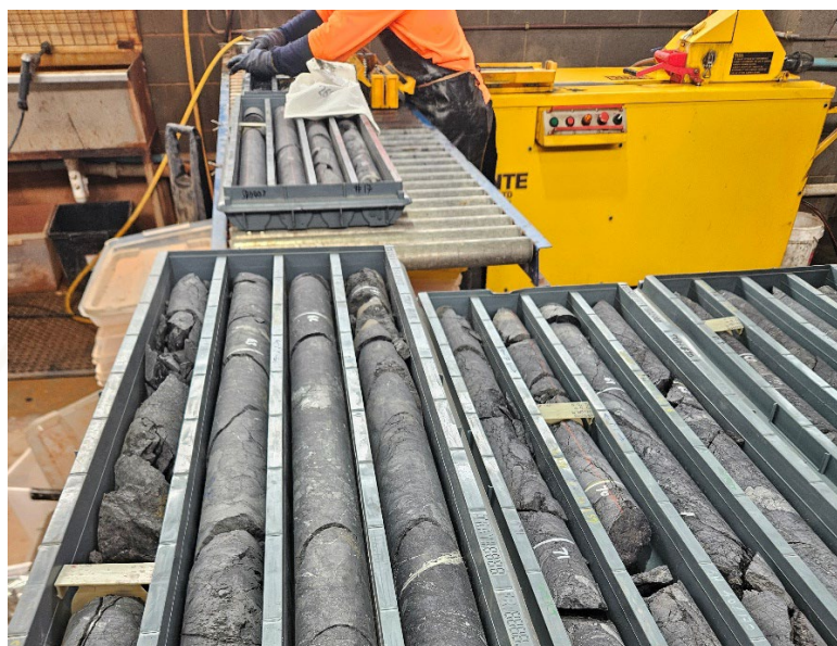
Figure 1: Tansey drill core being prepared at ALS Brisbane

NewPeak is targeting high-grade, large-scale gold mineralisation adjacent to and beneath the historic South Burnett Gold Mine, which was mined to a depth of ~80 metres in the 1940s and remains untested for significant depth extension. More information on Tansey can be found in NPM's ASX Announcement dated 11 July 2025.